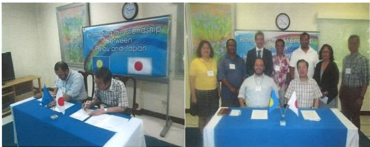
Signing of the Grant Contract on March 13, 2018

The Embassy of Japan in the Republic of Palau awarded the sum of $37,027 to the Palau SDA Elementary School for the renovation of a science laboratory and procurement of laboratory equipment pursuant to a Grant Contract executed between the Embassy of Japan and Palau SDA Elementary School on March 13, 2018, as shown below: