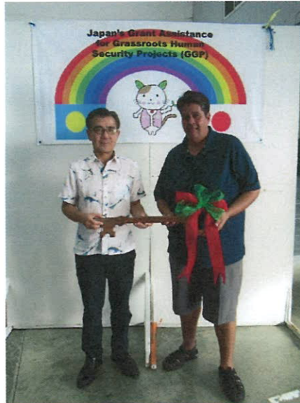
Handover ceremony on November 25, 2019

On November 25, 2019, the Renovated Science Lab with new equipment was turned over to the Palau SDA Elementary School in a formal Handover Ceremony shown below: